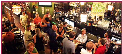
Logan's Irish Pub