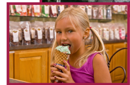
Dietsch's Ice Cream